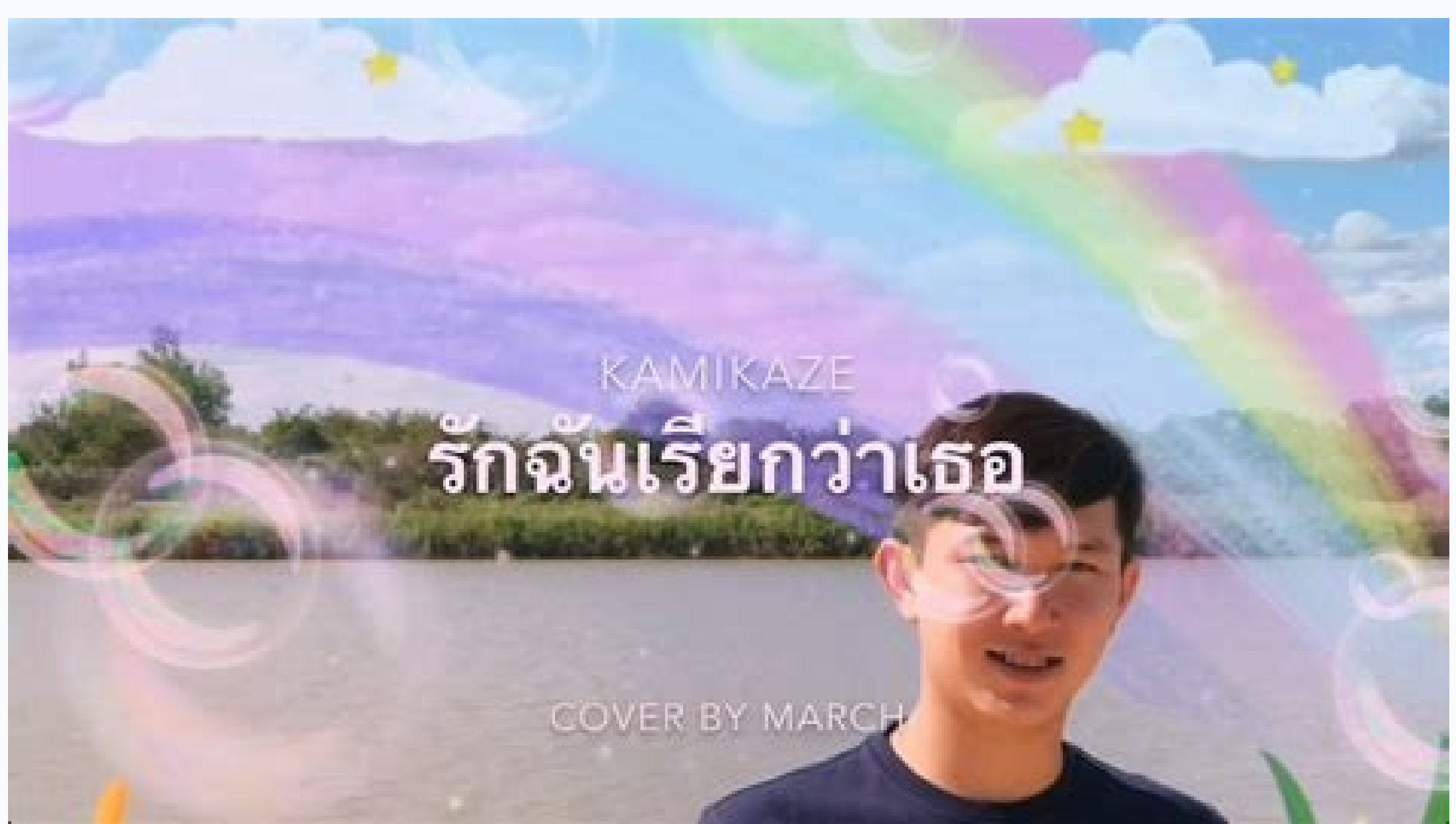
Kamikaze (eminem album).